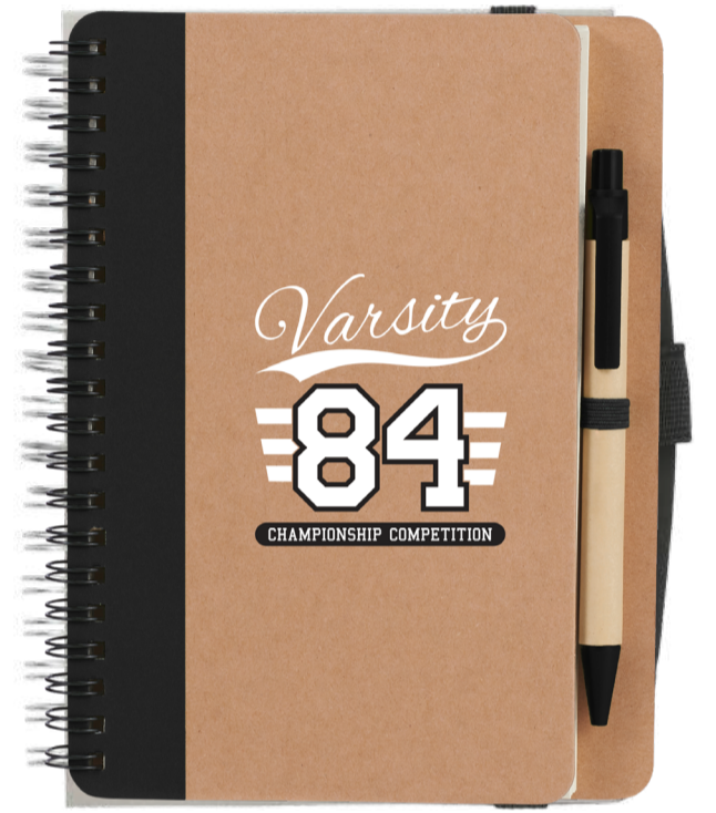
5" x 7" FSC® Mix Eco-Friendly Spiral Notebook with Pen