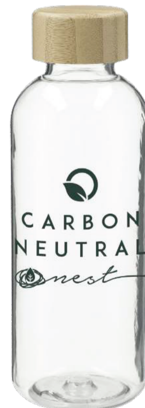
Sona 22oz RPET Reusable Bottle w/ FSC Bamboo lid