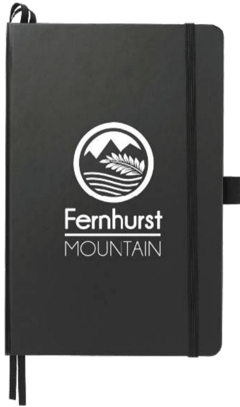
5.5" x 8.5" FSC® Mix Bound JournalBook

Gifts made with materials from responsibly managed forests.