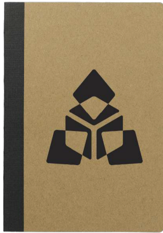
5" x 7" FSC® Mix Composition Notebook