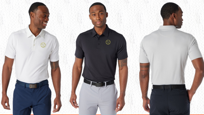
16675 MEN'S GREATNESS WINS ATHLETIC TECH POLO