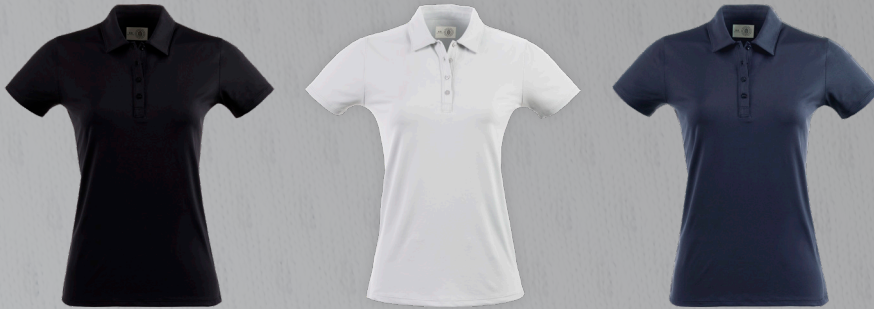
96675 WOMEN'S GREATNESS WINS ATHLETIC TECH POLO