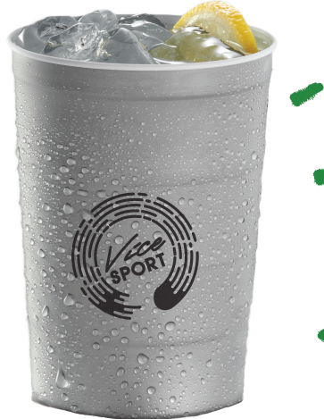
Recyclable Steel Chill-Cup™ 16oz I SM-6328 As Low As $2.63 ©