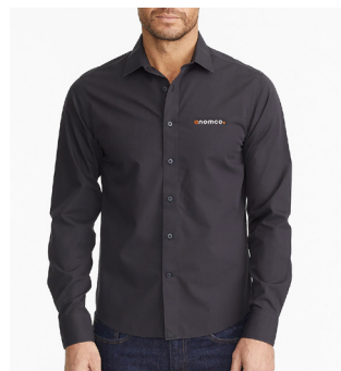
31360 - Black Stone Wrinkle-Free Long Sleeve Shirt - Men's Regular Fit TM31360 (S-3XL) Slim Fit TM31361 (S-2XL)