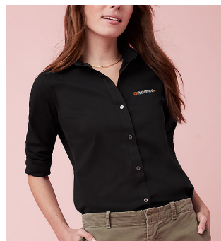
40190 - Bella Long Sleeve Shirt - Women's (XS-2XL)