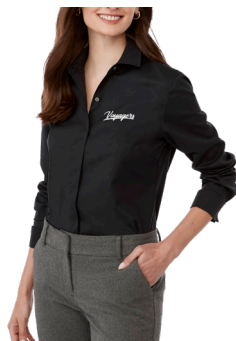
41309 - Tracey Long Sleeve Shirt - Women's (XS-2XL)