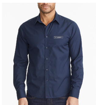
35686 - Castello Wrinkle-Free Long Sleeve Shirt - Men's Regular Fit TM35686 (S-3XL) Slim Fit TM35681 (S-2XL)