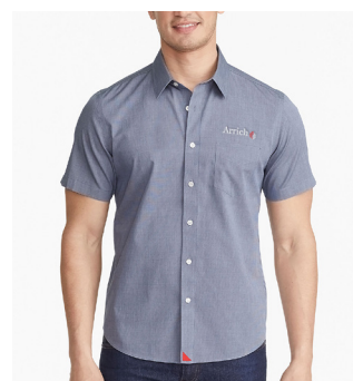
35454 - Petrus Wrinkle-Free Short Sleeve Shirt - Men's (S-3XL)