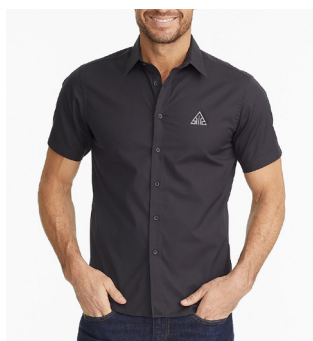
31264 - Classic Coufran Short Sleeve Shirt - Men's (S-3XL)