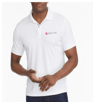
35510 - Damaschino Short Sleeve Polo - Men's (S-3XL)