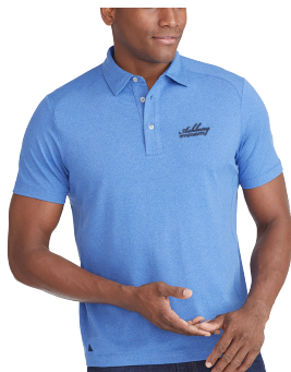
31436 - Performance Polo Men's (S-3XL)