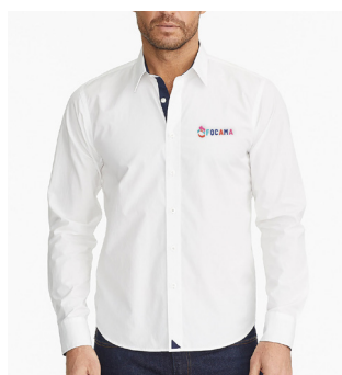
31537 - Las Cases Special Wrinkle-Free Long Sleeve Shirt - Men's (S-3XL)