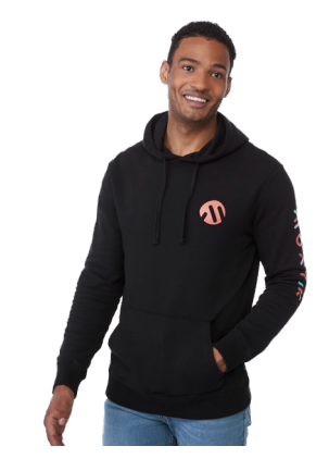
Organic Cotton Classic Hoodie M 18219 (S-2XL) • W 98219 (XS-XL) As Low As: $93.15[E]