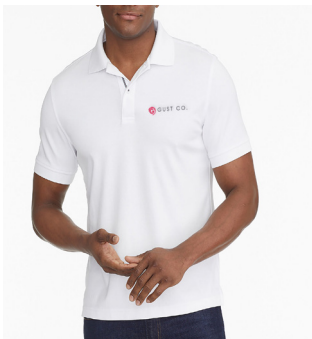
TM35510 - Damaschino Short Sleeve Polo - Men's (S-3XL)