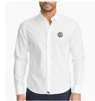
TM02060 - Las Cases Wrinkle-Free Long Sleeve Shirt - Men's Regular Fit TM02060 (S-3XL) Slim Fit TM02061 (S-2XL)