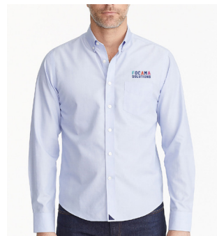
TM00121 - Hillside Select Wrinkle-Free Long Sleeve Shirt - Men's (S-3XL)