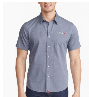
TM35454 - Petrus Wrinkle-Free Short Sleeve Shirt - Men's (S-3XL)