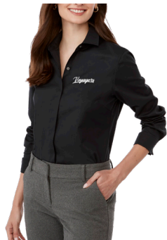
TM41309 - Tracey Long Sleeve Shirt - Women's (XS-2XL)