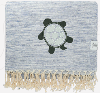
HILANA UPCYCLED YALOVA ULTRA SOFT MARBLED BLANKET | 1081-85 As Low As: $97.15 [D]