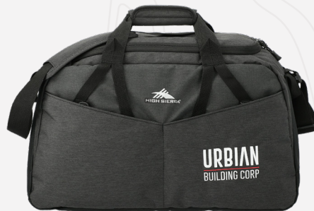
HIGH SIERRA® FORESTER RPET 22" DUFFEL | 8052-48 As Low As: $73.97 [D]