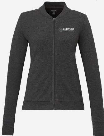
RIGI ECO KNIT FULL ZIP | 98157/18157 As Low As: $72.60 [c]

perfect for layering - breathable & moisture-wicking