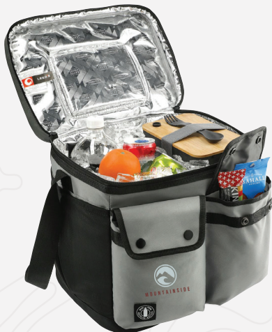
ARCTIC ZONE® REPREVE® 24 CAN DOUBLE POCKET COOLER | 3860-78 As Low As: $91.54 [D]