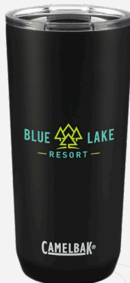
CAMELBAK® TUMBLER 200Z | 1627-37 As Low As: $46.74 [E]