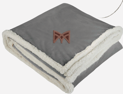
FIELD & CO. CAMBRIDGE OVERSIZED SHERPA BLANKET | 7950-51 As Low As: $90.17[c]