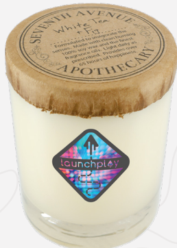
SEVENTH AVENUE APOTHECARY WHITE TEA AND FIG 11 OZ GLASS JAR CANDLE | 6000-01 As Low As: $54.22[c]