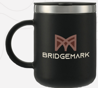
HYDRO FLASK® COFFEE MUG 12OZ | 1601-94 As Low As: $43.20[E]