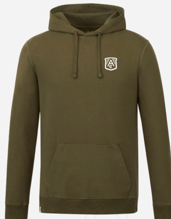
MEN'S TENTREE ORGANIC COTTON CLASSIC HOODIE | 18219 As Low As: $93.15[E]