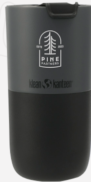
KLEAN KANTEEN ECO RISE 16OZ TUMBLER | 1600-54 As Low As: $48.64[E]