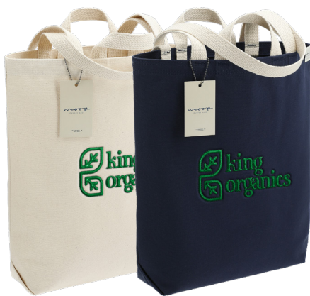
9005-04 MOOP® CARSON TOTE As Low As $65.59 [E]