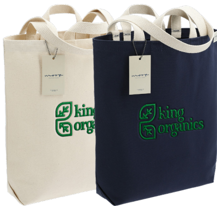
9005-04 MOOP® CARSON TOTE As Low As $39.99 [E]