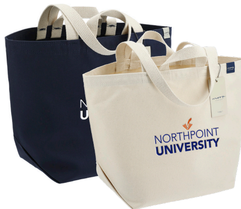
9005-03 MOOP® GRANDVIEW TOTE As Low As $44.99 [E]