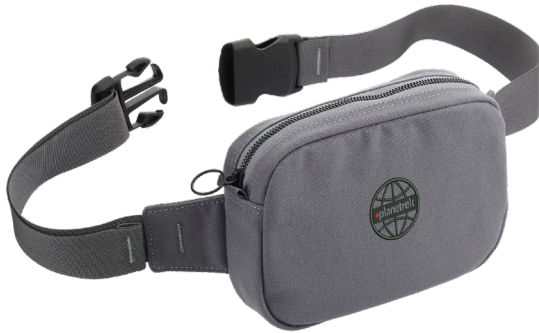
NEW! 9005-01 Moop® FANNY PACK As Low As $89.99 [E]

Moop® bags have a 14 year history of quality construction and durable materials from a female-owned American small business. Designed and manufactured in Seattle, Washington, these Moop® totes are made from untreated 100% cotton 12oz duck canvas fabric.