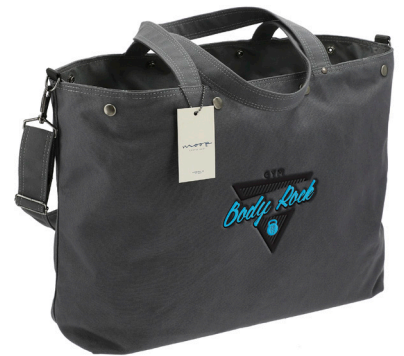
9005-22 MOOP® PORTER TOTE As Low As $179.99 [E]