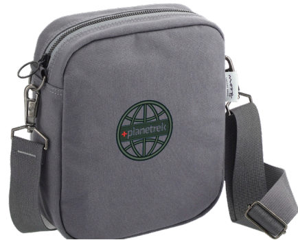
NEW! 9005-02 MOOP® WAYFINDER CROSSBODY TOTE As Low As $129.99 [E]