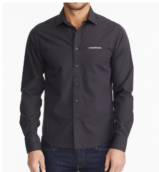
31360 - Black Stone Wrinkle-Free Long Sleeve Shirt - Men's Available in Regular and Slim Fit (31361)