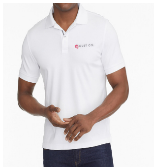
35510 - Damaschino Short Sleeve Polo - Men's