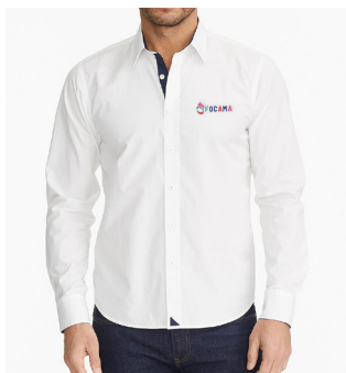
31537 - Las Cases Special Wrinkle-Free Long Sleeve Shirt - Men's