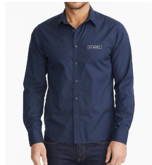
35686 - Castello Wrinkle-Free Long Sleeve Shirt -Men's Available in Regular and Slim Fit (35681)