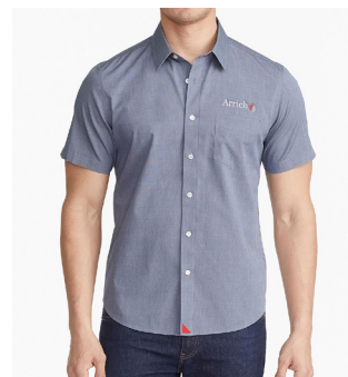
35454 - Petrus Wrinkle-Free Short Sleeve Shirt - Men's