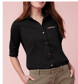
40190 - Bella Long Sleeve Shirt - Women's