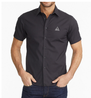
31264 - Classic Coufran Short Sleeve Shirt - Men's