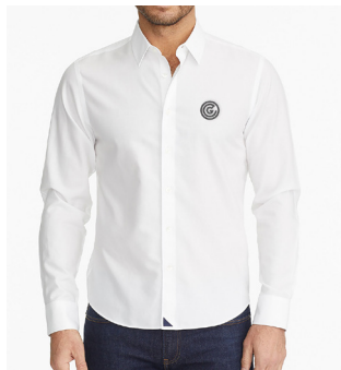
02060 - Las Cases Wrinkle-Free Long Sleeve Shirt - Men's Available in Regular and Slim Fit (02061)