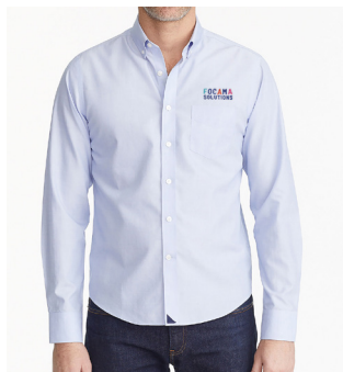
00121 - Hillside Select Wrinkle-Free Long Sleeve Shirt - Men's