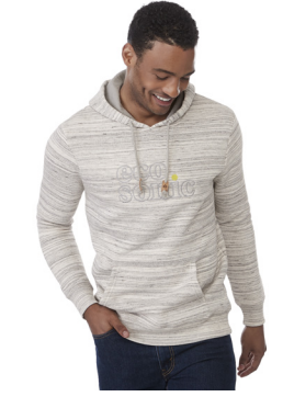
Space Dye Classic Hoodie M 18218 (S-2XL) • W 98218 (XS-XL) As Low As: $93.15[c]