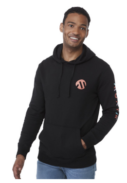
Organic Cotton Classic Hoodie M 18219 (S-2XL) • W 98219 (XS-XL) As Low As: $93.15 [c]