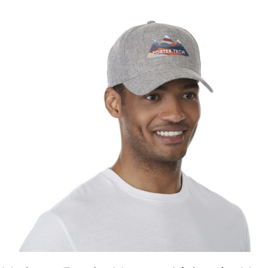
Unisex Basic Hemp Altitude Hat U 32034 (OS) As Low As: $50.15 [c]