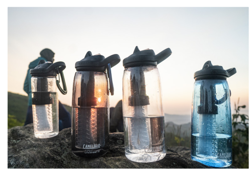
For every CamelBak® filtered by LifeStraw® product purchased, a child in need receives safe drinking water for an entire year.