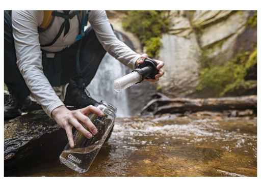
Water is filtered twice to remove bacteria, parasites, and microplastics.