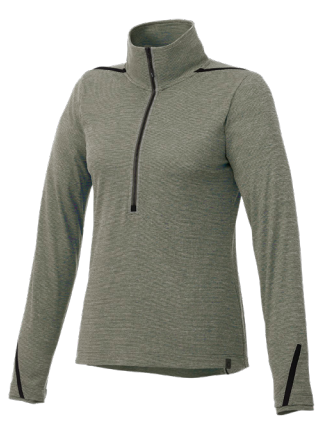
TM98306/TM18306 DEGE Eco Knit Half Zip As Low As $48.67 [C] MIN QTY: 12