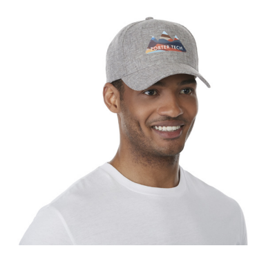
Unisex Basic Hemp Altitude Hat U TM32034 (OS) As Low As: $39.64 [E]