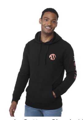
Organic Cotton Classic Hoodie M TM18219 (S-2XL) • W TM98219 (XS-XL) As Low As: $82.64 [E]