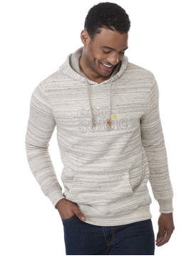
Space Dye Classic Hoodie M TM18218 (S-2XL) • W TM98218 (XS-XL) As Low As: $82.64 [E]