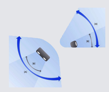
Hear It Like It's Live Hit the LIVE SOUND button and hear your music in a whole new way. Bring your party to life with a unique three-dimensional sound experience.

Light Up The Party The SRS-XB33 features a speaker light and multi-color line that flash with the beat. You can even change the color of the line to suit your mood.