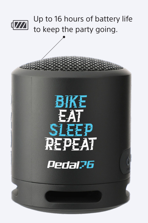
7195-50 SONY® SRS-XB13 Bluetooth® Speaker As Low As: $74.99[G] MIN QTY: 4