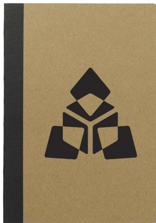
5" x 7" FSC® Mix Composition Notebook