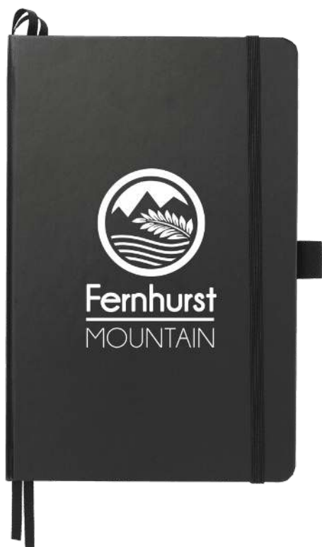
5.5" x 8.5" FSC® Mix Bound JournalBook

Gifts made with materials from responsibly managed forests.