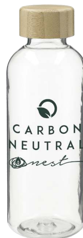
Sona 22oz RPET Reusable Bottle w/ FSC Bamboo lid