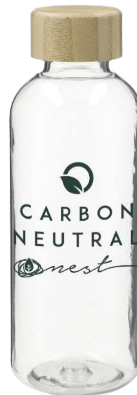
Sona 22oz RPET Reusable Bottle w/ FSC Bamboo lid