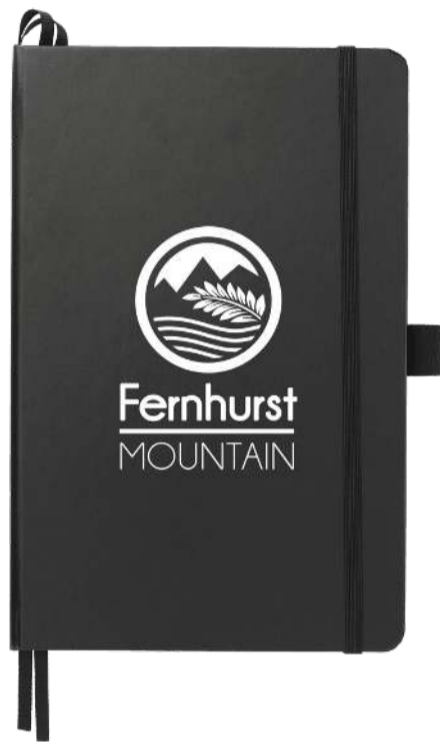
5.5" x 8.5" FSC® Mix Bound JournalBook

Gifts made with materials from responsibly managed forests.