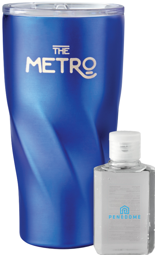
B. It's more important than ever to keep those hands clean.